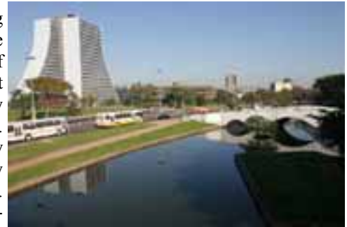
Porto Alegre, Brazil: This old stone bridge was built by Portuguese Colonizers

Since its beginning 58 years ago, the World Council of Churches has met in full assembly only eight times. The first assembly was held in the city of Amsterdam. Subsequent assemblies have been hosted in Evanston, Illinois (1954); New Delhi, India (1961); Uppsala, Sweden (1968); Nairobi, Kenya