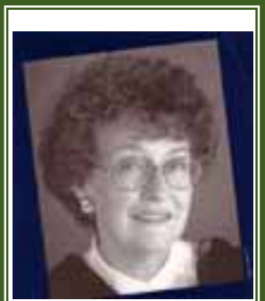
Mary Pratt, renowned artist and special friend of Wilmot United Church, shares her personal experiences of “seeing with the heart” at the Wilmot Winter Retreat at Beulah Camp, Brown’s Flat, NB, February 17 to 19.

Those who attend will explore their own creative responses to life with opportunities to experience music, creative writing, sign language, meditative painting, mandalas and prayer beads.